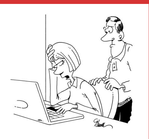
"Do we have to be Facebook friends? Isn't being married enough?"

On a window of a New Hampshire hamburger restaurant: "Yes, we are open. Sorry for the inconvenience."